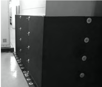
Interior Wall Barrier With Corner