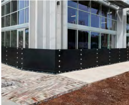
Storefront Flood Protection