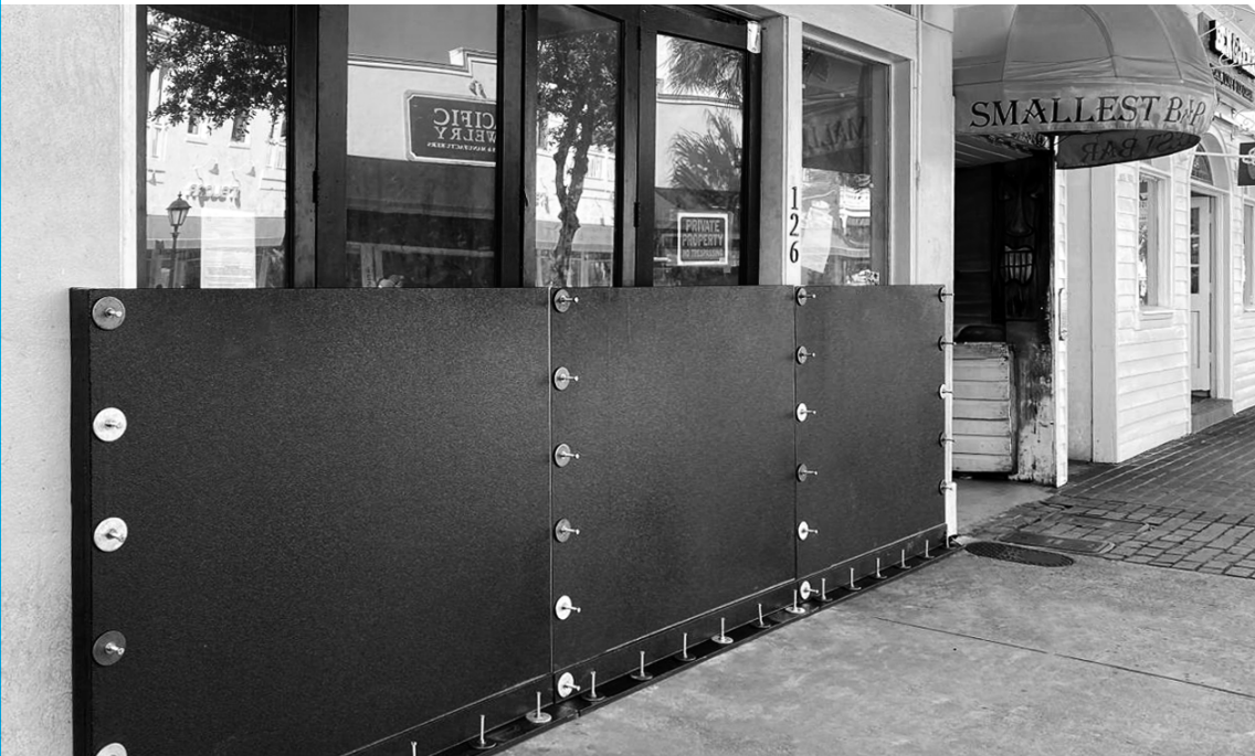
Storefront Protection Door + Window Barrier

The Flood Risk America (FRA) Flood Panel uses sustainable flood-seal technology to protect any opening against flood water + is highly resistant to heavy impact forces. Each panel is custom-engineered to meet individual installation requirements + job-specific demands. It is easy to install, deploy, + remove.